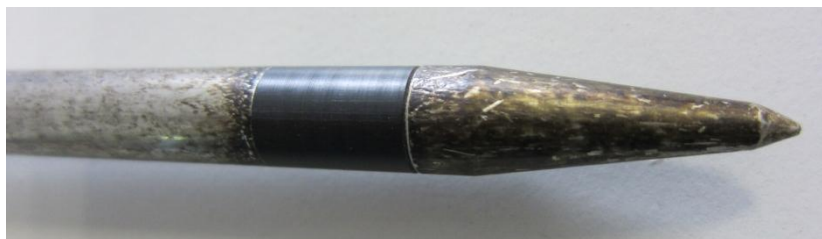
Soilded probe -> wrong measuring!

Especially when measuring in wet hay, the probe may be soiled very strong, this may produce to low measuring displays.